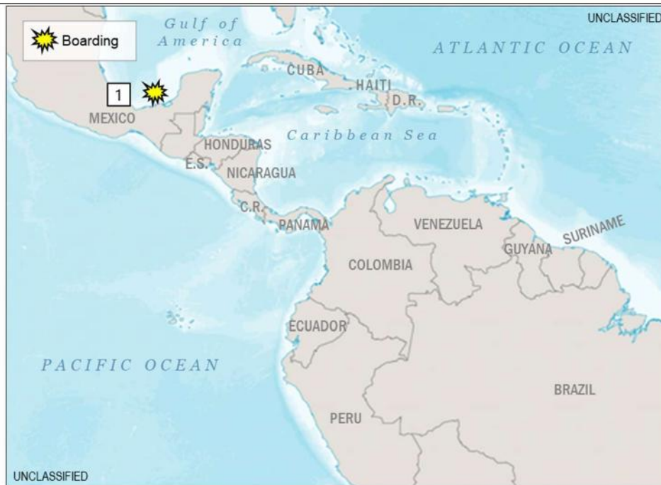
(U) Figure 1. Piracy and Armed Robbery at Sea in the Gulf of America